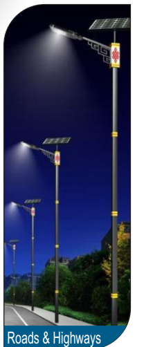
Roads & Highways