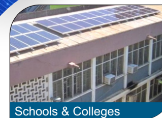
Schools & Colleges