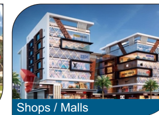
Shops / Malls